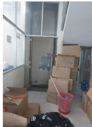
Figure 20: Elevator safety door not closed exposing elevator shaft