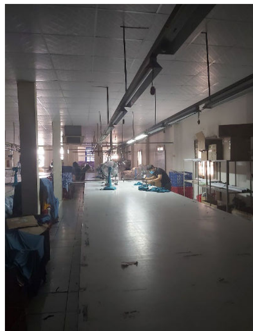
Figure 1: Worker in cutting operation without protective metal mesh gloves

The WRC observed that one first aid cabinet (first aid kit) was provided on each floor of the factory. However, the kits did not contain all the first aid supplies that the law specifies must be maintained ( see Figure 2 ). Moreover, the kits contained various medicines, which the law prohibits from being kept in such kits (as they should be dispensed by a health provider). Failure to properly maintain first aid kits is a violation of Vietnamese law and, by extension, Covered California's labor standards.