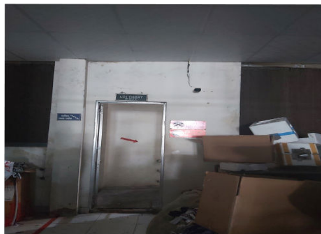
Figure 6: Open door to emergency exit stairwell