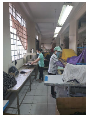
Figure 22: No anti-fatigue mats provided for workers in standing jobs