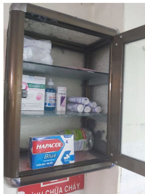
Figure 2: First aid cabinet not adequately stocked and improperly contains medicines