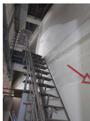
Figure 13: Lack of emergency lighting in stairwell