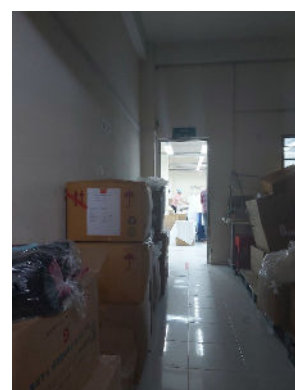
Figure 14: Lack of emergency lighting at and along exit door