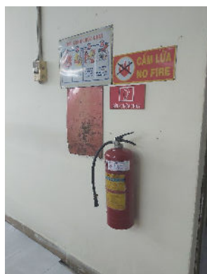
Figures 11 and 12: Fire extinguishers not checked regularly

The WRC's inspection found that there was no record of the factory's fire extinguishers being regularly checked ( see Figures 11 and 12 ). Moreover, the factory lacked any form of smoke or fire detector. Finally, no emergency lighting had been installed on the factory's emergency exit routes ( see Figures 13 and 14 ). All of these conditions posed safety hazards that violated Vietnamese law 49 and/or Covered California's labor standards.