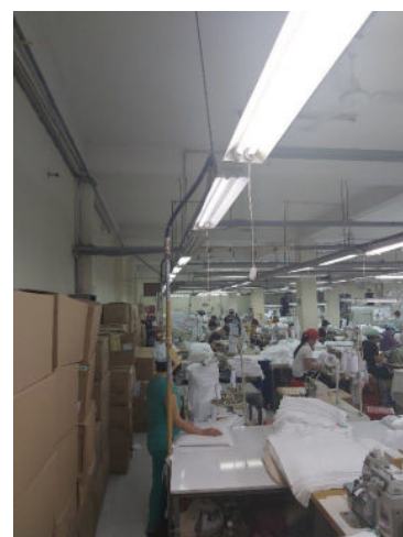
Figures 8–10: Emergency evacuation routes obstructed