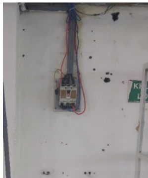
Figure 15: Uncovered electrical switch and wiring

The WRC found that Can Man had not tested its electrical system since 2014. The WRC found numerous conditions that posed electrical hazards including electrical wiring and switches that were not properly covered and electrical panel boxes whose covers were left open ( see Figures 15–18 below ). All of these conditions posed safety hazards that violated Vietnamese law, 50 and/or Covered California’s labor standards.