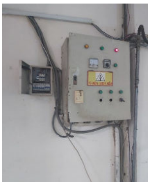
Figure 16: Open electrical panel box