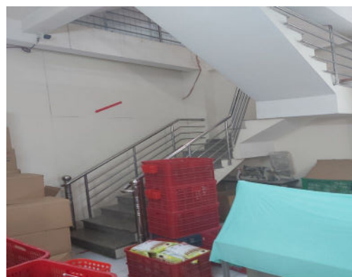
Figure 7: Open stairwell with landing obstructed by flammable boxes and obstructed exit route

Finally, the landing of one of the exit staircases on the ground floor was obstructed by materials ( see Figure 7 ). As a result, if access to the other exit staircase were blocked by fire or other obstruction, in case of emergency, workers would, again, be unable to quickly exit the building. It was also observed that, on the factory floors, the aisles which provide routes to the emergency exits are obstructed at many places, which would, again, prevent workers from exiting the factory quickly in case of a fire ( see Figures 7 to 10 ).