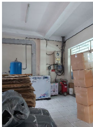
Figure 19: Air compressor not inspected

Moreover, neither the factory's air compressor nor the building's elevator had current inspection certificates, with the last documented inspection certification for the compressor having expired in 2018 and no certificate at all available for the elevator. The latter omission was of particular concern as the elevator safety door on the ground floor was observed to remain open when the lift has traveled to the upper floors of the building, with the open elevator shaft posing a serious hazard (see Figures 19 and 20).