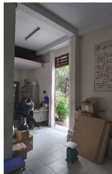
Figure 4: Only one exit on ground floor of factory

In addition, the entrances to the exit stairways on the upper floors are not enclosed as would be needed to maintain fire separation and prevent them from filling with smoke and becoming impassable in case of a fire on the lower floors (see Figure 5). The main stairwell in the middle of the building is not enclosed to prevent spread of smoke, and, while the exit stairwells on the end of the building have doors, during the WRC's inspection, these were observed to be kept open, thereby negating any fire separation (see Figure 6). Moreover, it was unclear whether these doors were fire-rated and unlockable.