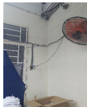
Figures 17 and 18: Uncovered wiring