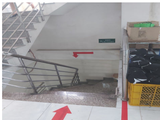
Figure 5: Unenclosed exit stairwell

In addition, the entrances to the exit stairways on the upper floors are not enclosed as would be needed to maintain fire separation and prevent them from filling with smoke and becoming impassable in case of a fire on the lower floors (see Figure 5). The main stairwell in the middle of the building is not enclosed to prevent spread of smoke, and, while the exit stairwells on the end of the building have doors, during the WRC's inspection, these were observed to be kept open, thereby negating any fire separation (see Figure 6). Moreover, it was unclear whether these doors were fire-rated and unlockable.