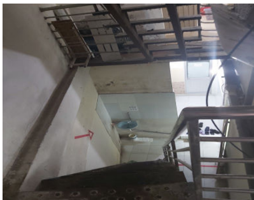
Figure 3: Stairwell exiting to toilet, not building exterior

However, on the ground floor there is only one exit toward the street, and there is no exit on the other side of the building. Instead, one of the stairwells exits to the ground floor toilet, rather than to the exterior (see Figures 3 and 4). Therefore, if the sole exit that leads to the exterior were to be obstructed or unusable in case of an emergency, workers could be trapped inside the building.