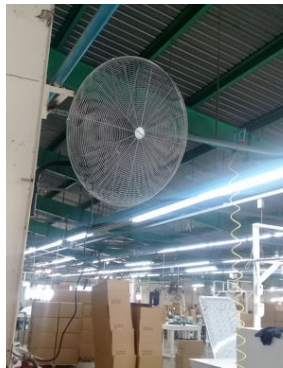
The installation of additional fans helps to provide additional ventilation.

As per requirements of Dominican law, Alta Gracia has a functioning Health and Safety Committee. The Committee is comprised of six members, one of whom is a representative of the SITRALPRO union. 16 In the WRC's monitoring report on Alta Gracia for the previous monitoring period, September 2017 - August 2018, 17 we noted the fact that the company fell short of the legal requirement that the Committee should meet one time per month. 18 In its report, the WRC recommended that the factory ensure that the Committee was compliant with the law by holding a meeting once every month. During the current monitoring period, the Committee met a total of eight times. While this represented an improvement over the previous monitoring period, the factory did not fully comply with the requirement that the Committee should meet once a month.