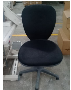
The factory purchased new chairs that meet ergonomic standards for garment workers.

The WRC continues to recognize Alta Gracia's efforts to maintain excellence in factory health and safety and to invest resources into making continued improvements. The WRC's sole recommendation with regard to factory health and safety is that the factory continue to make every effort to ensure that the Health and Safety Committee comply with Dominican labor law by holding a