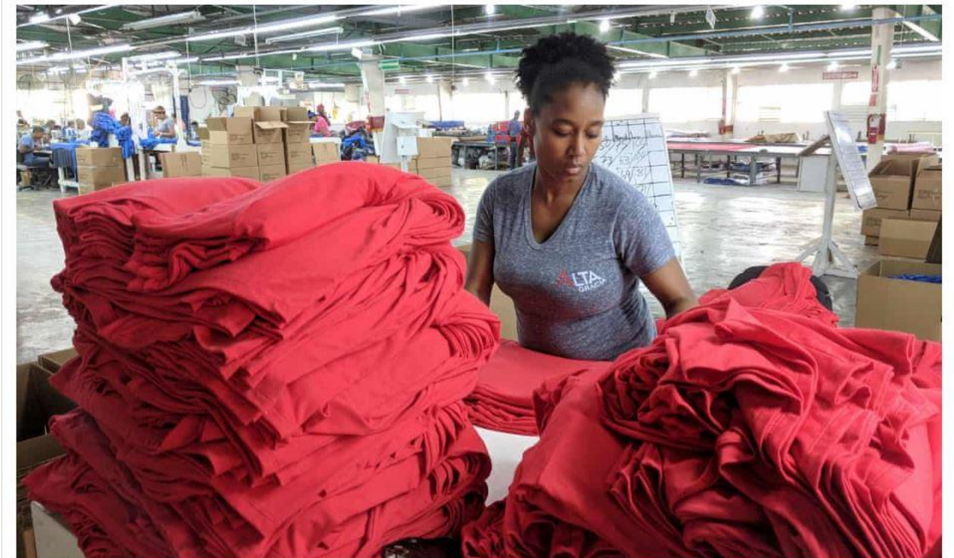
▲ The Alta Gracia garment factory in the Dominican Republic.