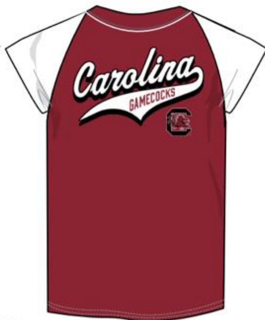
MPR001 COLOR BLOCK FULL BUTTON BASEBALL TEE LEFT CHEST GRAPHIC: VG0088 CENTER BACK GRAPHIC: TBD004