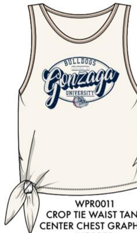
WPR0011 CROP TIE WAIST TANK CENTER CHEST GRAPHIC: VG0059