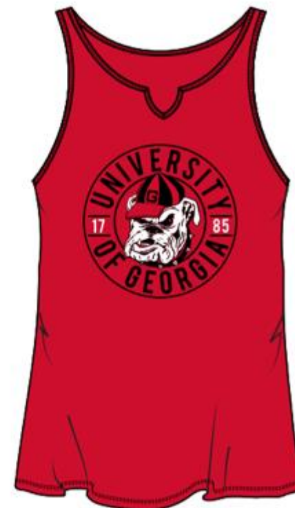
WPR0010 FLOWY TANK CENTER CHEST GRAPHIC: VG0060