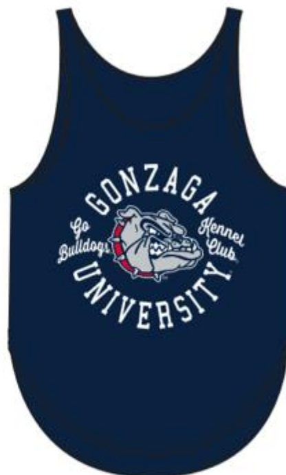
WPR008 FEATHERFEEL ULTRA BOXY DROPTAIL TANK CENTER CHEST GRAPHIC: VG0058