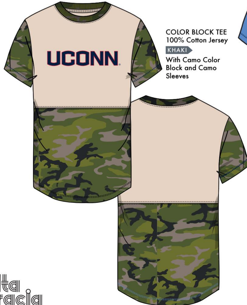
COLOR BLOCK TEE 100% Cotton Jersey KHAKI With Camo Color Block and Camo Sleeves