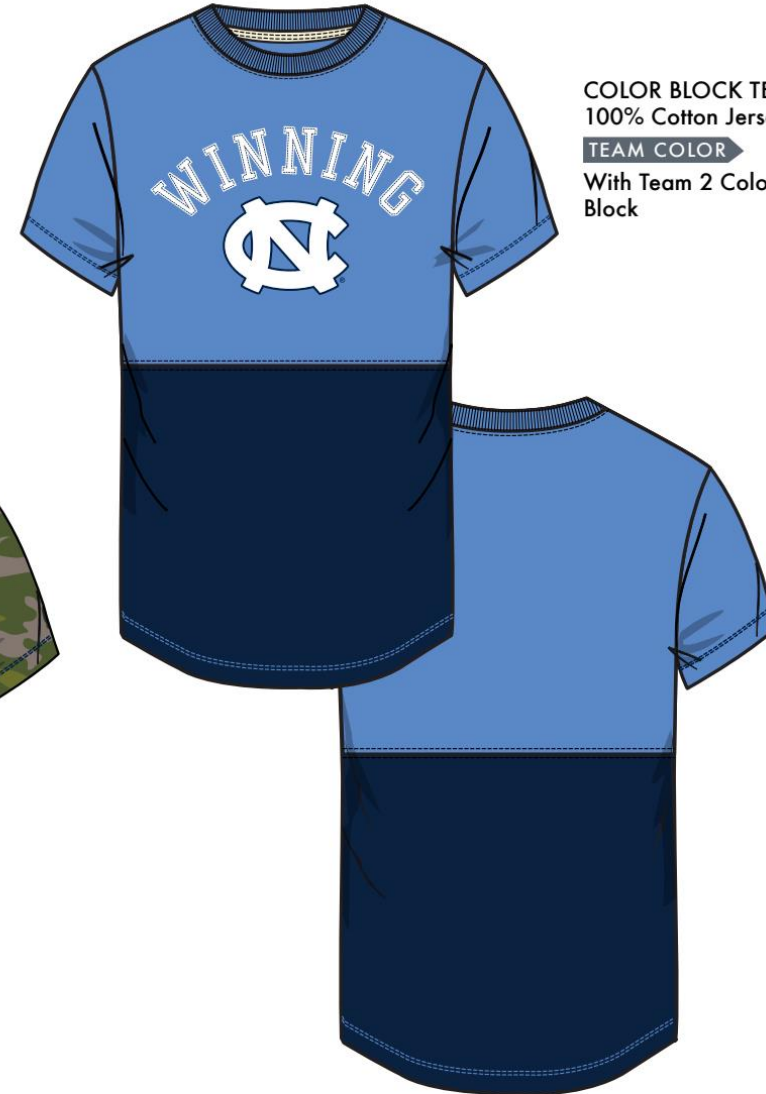
COLOR BLOCK TEE 100% Cotton Jersey TEAM COLOR With Team 2 Color Block