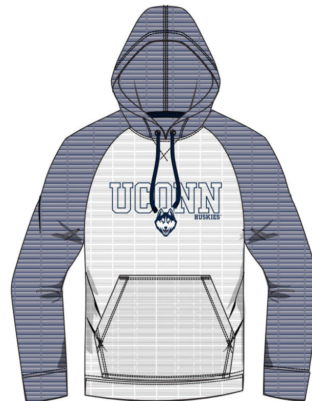
DAL03 STRETCH THERMAL HOODIE Cross Dye Waffle Fabric