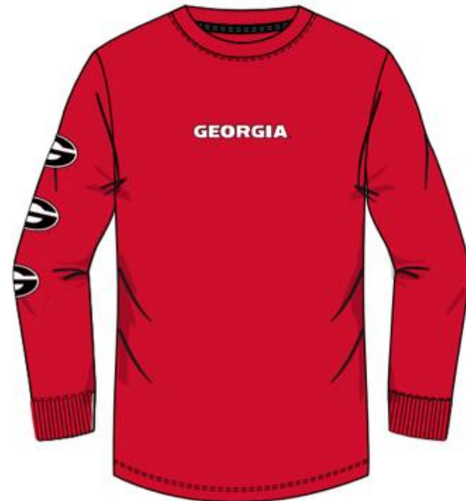
MHA23 | DIEGO CENTER CHEST GRAPHIC: TBD030 RIGHT SLEEVE GRAPHIC: TBD031