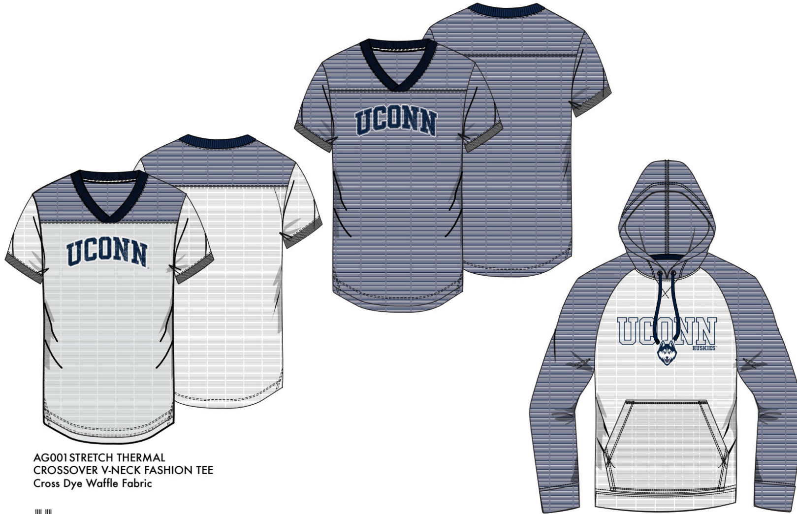
AG001 STRETCH THERMAL CROSSOVER V-NECK FASHION TEE Cross Dye Waffle Fabric