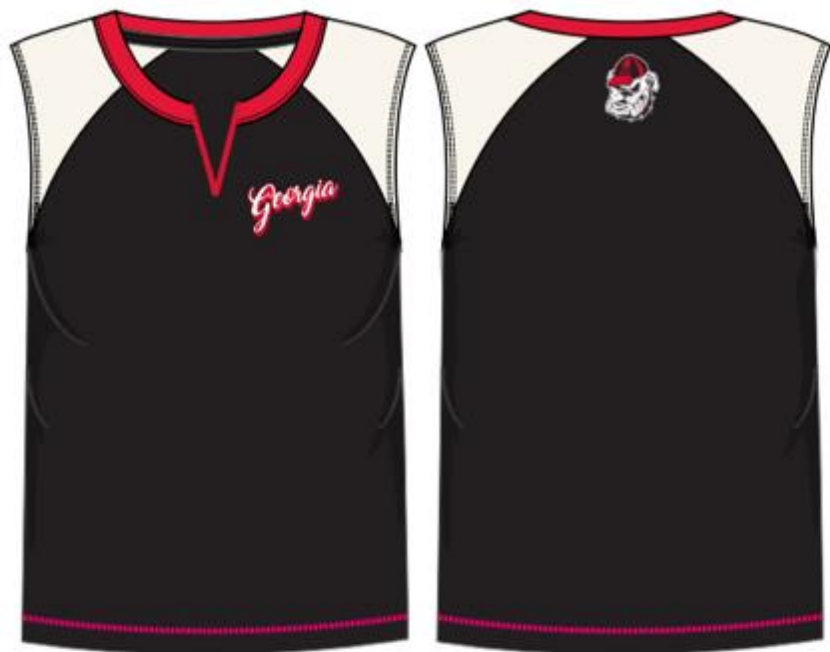
WPR0014 BOXY MUSCLE TANK LEFT CHEST GRAPHIC: VG0056 BACK NECK GRAPHIC: VG0057