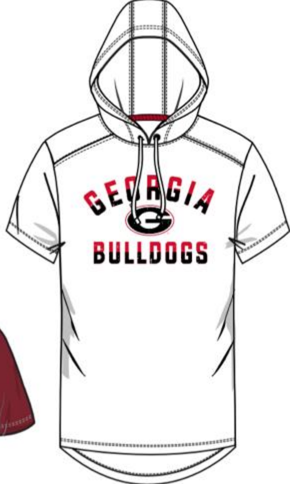
MPR003 SHORT SLEEVE TEE WITH HOOD CENTER CHEST GRAPHIC: VG0106