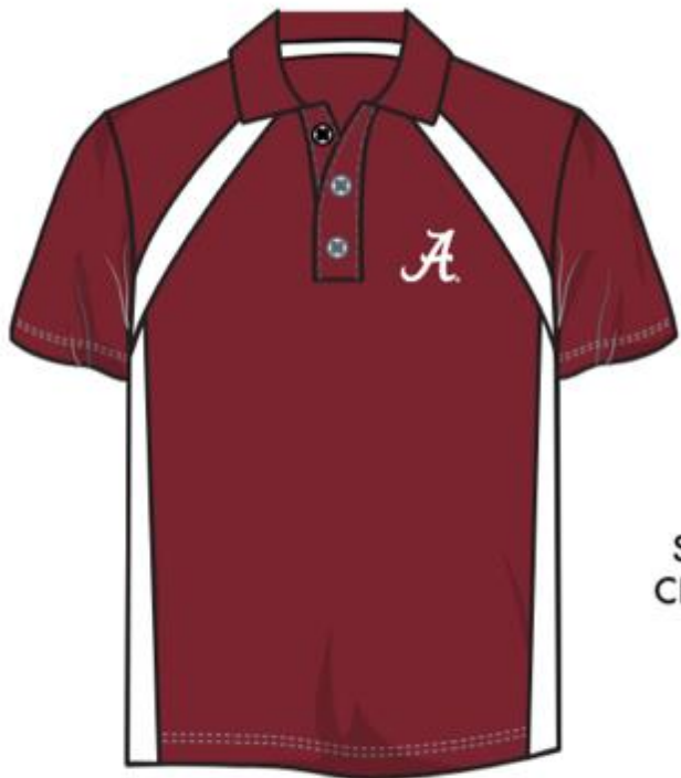
BPR004L COLOR BLOCKED POLO LEFT CHEST GRAPHIC: VG0074