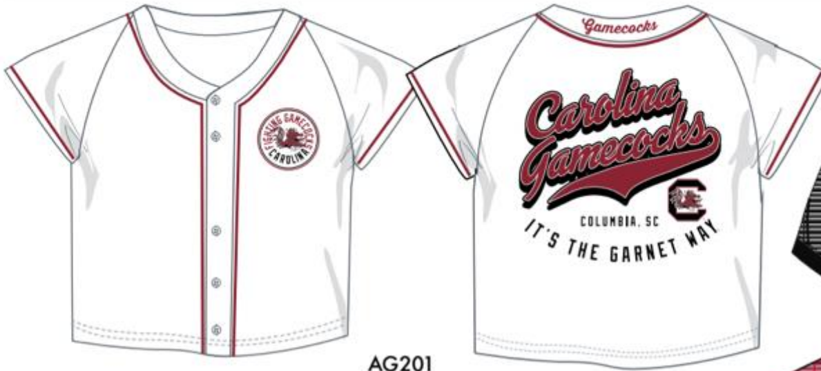
AG201 CROPPED BASEBALL TEE LEFT CHEST GRAPHIC: VG0070 CENTER BACK GRAPHIC: VG0071