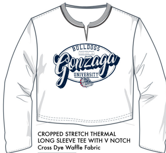
CROPPED STRETCH THERMAL LONG SLEEVE TEE WITH V NOTCH Cross Dye Waffle Fabric