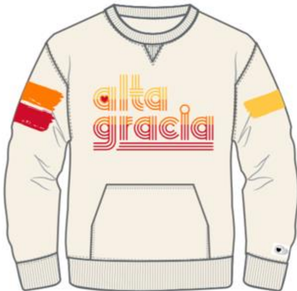
NATURAL 11-0103 TCX