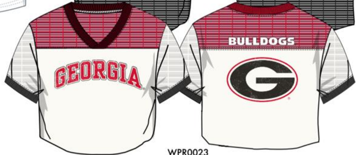
WPR0023 CROPPED FOOTBALL TEE CENTER CHEST GRAPHIC: IN1070 CENTER BACK GRAPHIC: VG0105