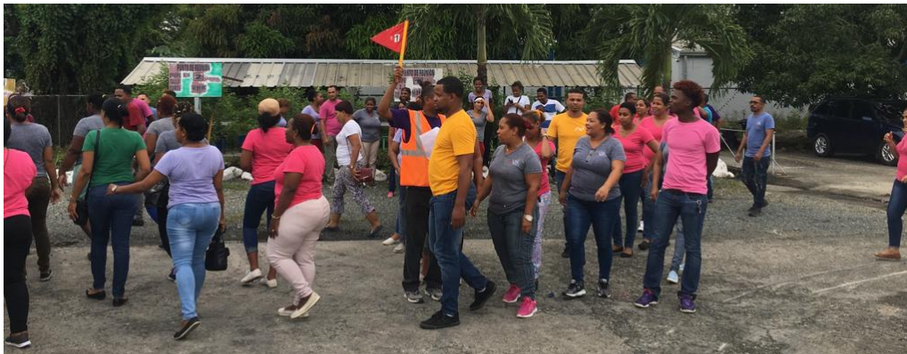
One of the health and safety brigades assists workers with an emergency drill.