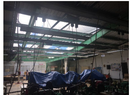
Factory roof undergoes repairs.