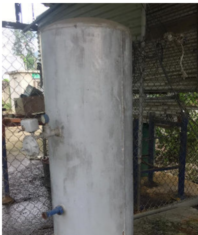
The pump that generates water to the cooling system was replaced.