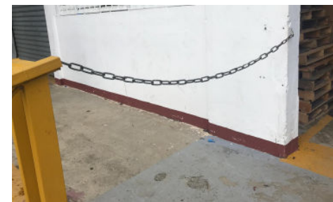
Additional safety for loading dock.