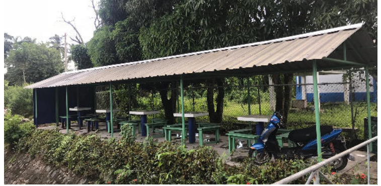
The roof on the outdoor eating area was rebuilt.