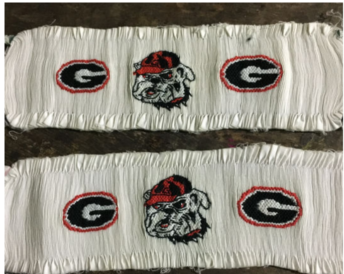
Figure 1: University of Georgia Bulldogs logos embroidered by homeworkers for Vive la Fete.

Although VLF denied that this announcement constituted a threat of retribution against the homeworkers, 7 the clear implication was that the homeworkers would lose a source of work and income as a direct result of their reporting the violation of their labor rights to the WRC and the WRC’s seeking corrective action. The WRC communicated to VLF that this announcement constituted a retaliatory threat against the homeworkers that further violated university codes of conduct. The WRC has received no further information from VLF and, in particular, no indication that the threat to eliminate this source of income for the homeworkers has been withdrawn.