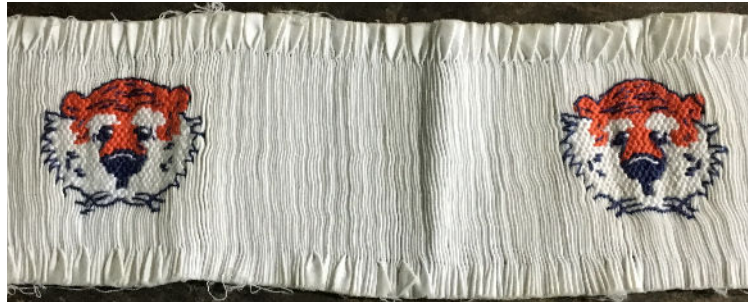
Figure 2: Auburn University Tigers logos embroidered by homeworkers for Vive la Fete.