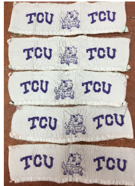
Figure 1: Texas Christian University Horned Frogs logos embroidered by homeworkers for Vive la Fete.