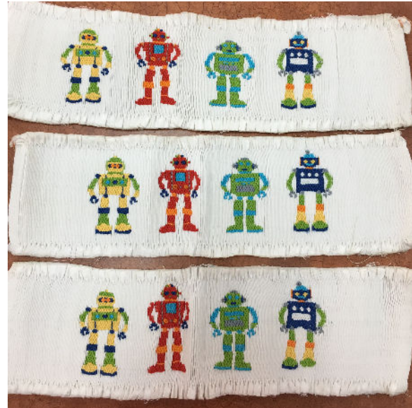
Figure 2: Images of robots embroidered by homeworkers for Vive la Fete.

When the WRC – responding to a complaint received from the Salvadoran women’s organization, Mujeres Transformando – first contacted Konffetty in April 2017 and requested information concerning the factory’s use of homeworkers, Konffetty responded to the WRC that it did not employ homeworkers and therefore did not have any reason to respond to the WRC’s inquiry. This response was misleading and, as VLF subsequently acknowledged, the Konffetty factory uses homeworkers to perform embroidery work on its products. According to both Salvadoran government labor inspectors and independent investigative journalists, companies like Konffetty, that use homeworkers to embroider garments, often conceal or deny this practice, in part, to avoid enrolling and paying contributions for the homeworkers in the country’s public healthcare and pension programs. 39