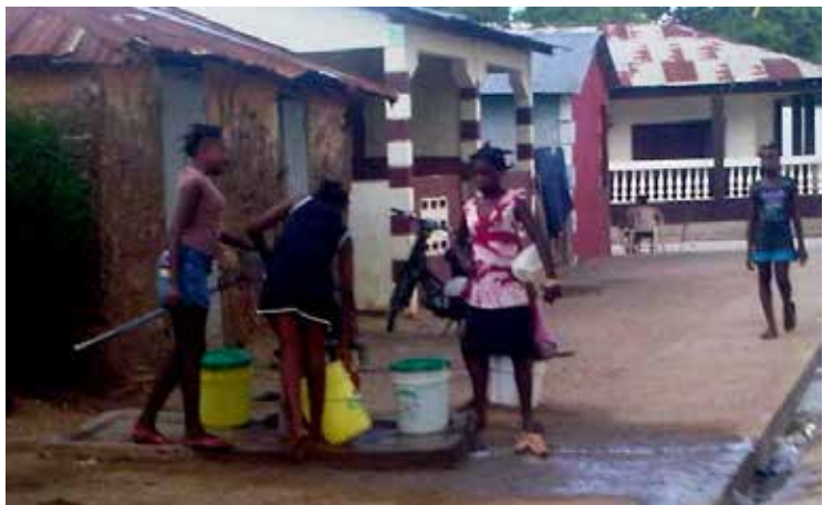
The Public well in the community of Terrier Rouge where many Caracol workers live

One worker reported that, although he had developed skin rashes as a result of exposure to chemicals and fiber dust in the factory where he worked, he could not afford medication and therefore his condition remained untreated. This worker also has a dependent with a chronic condition that requires medical attention twice monthly, but the worker reports that he could only afford to take his dependent to the doctor three times over the past year.