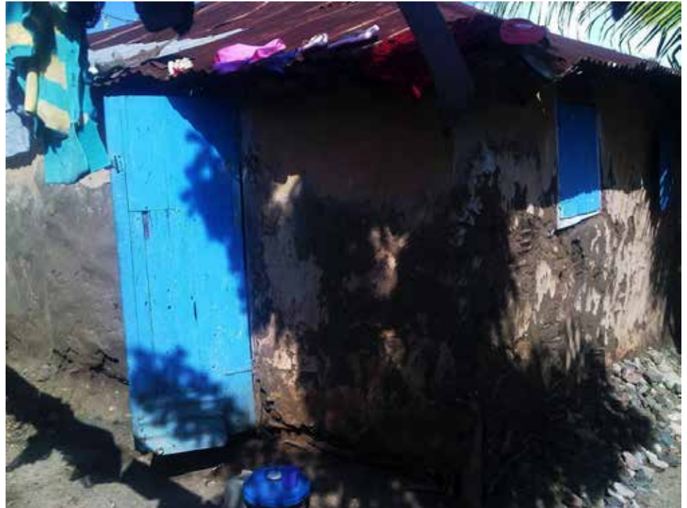
The exterior of a Caracol worker's dwelling in Terrier Rouge

Haitian law requires that any hours worked in excess of eight hours per day or 48 hours per week be compensated at a premium rate of 150% of the worker's wage rate for ordinary hours. 37 Applied to the minimum wage for production and piece rate workers this premium rate is 56.25 HTG per hour. 38