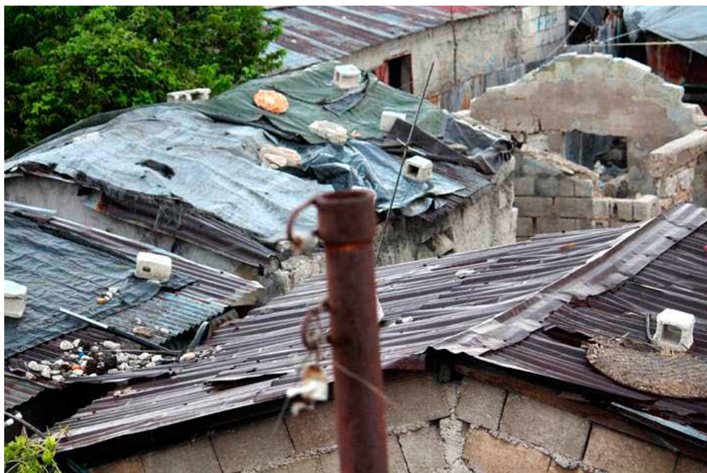
Earthquake damaged dwellings with tarp-covered roofs in the Cite Soleil slums of Port-au-Prince

Workers reported that the conditions of the housing they can afford is poor with no running water and varying degrees of access to erratic electricity, and often in neighborhoods that are unsafe. For example, Cite de Soleil, a district of Port-au-Prince where garment workers live has been described as “one of the hemisphere’s most miserable slums.” 74 Some workers stated that after the 2010 earthquake they were unable to afford to move or rent new shelter and that they continue to live in homes that were seriously damaged.