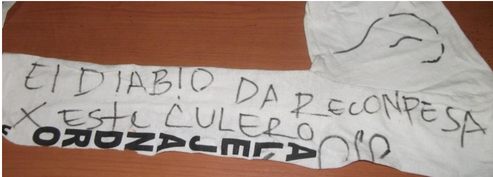
Illustration 11 (Surveillance of Employee Union Members and Leaders) 59