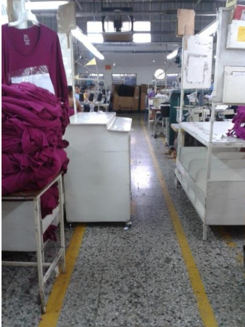
Illustration 2 (Fire Safety: Locker Area)