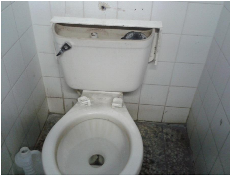
Illustration 4 (Condition and Capacity of Bathrooms: Locked Door to Broken Toilet)