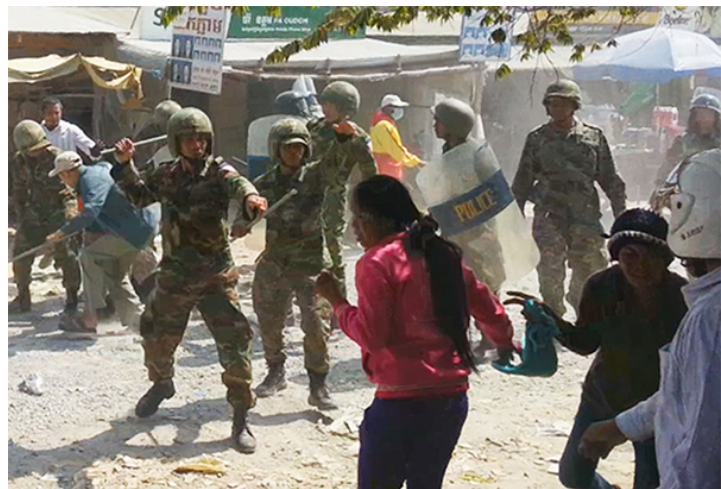
Military combat unit attacks protesting garment workers outside Yakjin Garment factory, a supplier to Gap and Walmart.

The price squeeze confronting Cambodian garment factory owners – between the demands of brands and retailers for cheap apparel and the demands of garment workers for livable wages – explains not only why the industry has so aggressively opposed a significant increase in the minimum wage (even though real wages for Cambodian garment workers are no higher today than they were in 2000), but also why, since the mass protests erupted, industry leaders have tended to support escalation and confrontation over a negotiated settlement between labor and management. To cite just one example of this tendency, when workers at some factories launched a strike in mid-December in support of a higher minimum wage, the factory owners' organization, the Garment Manufacturers Association in Cambodia (GMAC) called for, in effect, a nationwide lockout of the industry's workers by its members, dramatically expanding the dispute. 12