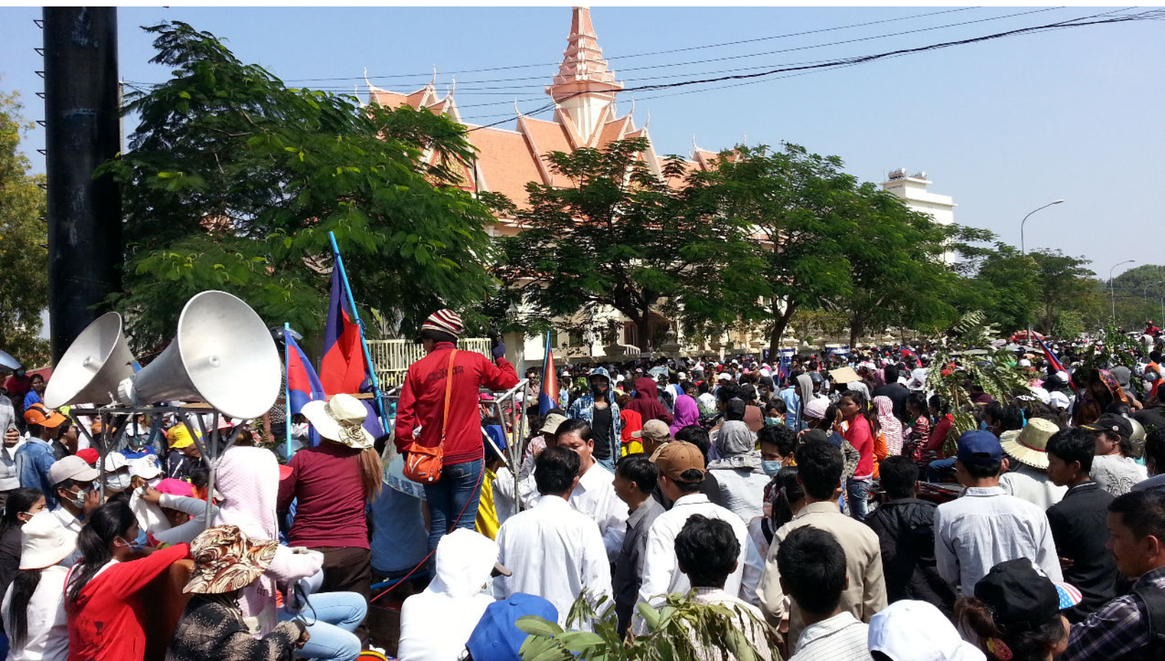
Garment workers march on December 27 calling for increase in their wages – the world's second-lowest among major garment-exporting countries.