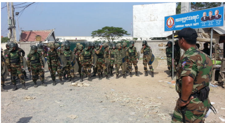
Government calls in army special forces unit against protest by garment workers and Buddhist monks outside Gap and Walmart supplier Yakjin Garment.