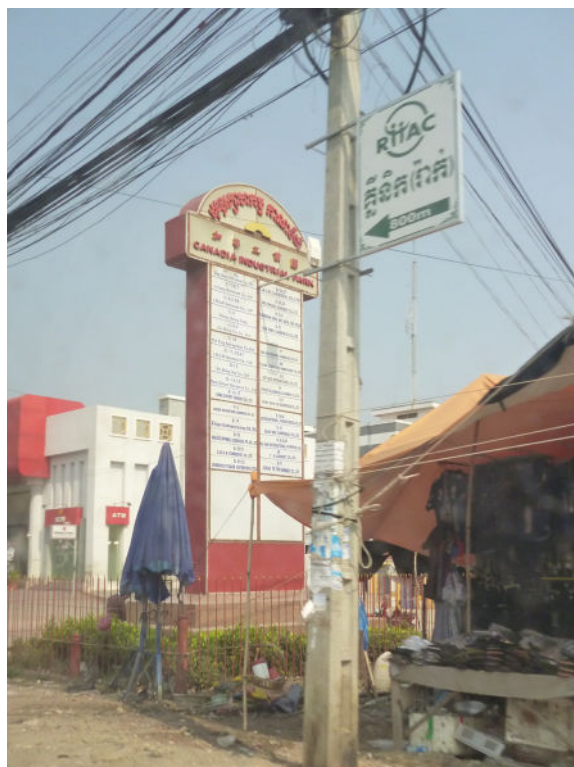
Canadia Industrial Park, site of the worst violence against protesting garment workers.

Japanese investors also requested government intervention through their embassy. According to an official of Cambodia's Interior Ministry, the Japanese Embassy in Phnom Penh lodged an official complaint with the ministry citing concerns about "radical" protesters. The Japanese Embassy confirmed it had requested the Cambodian government to protect Japanese factories and staff, but said that its representatives had insisted on a nonviolent approach. 148