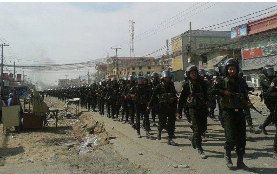
Military forces massing in areas with concentrations of garment factories (early January).

On February 19, the ITUC, IndustriALL and UNI, along with a number of international apparel firms, including H&M, Gap, and Puma, met with Cambodian government representatives concerning the setting of the minimum wage, the development of legislation regulating trade unions, and the status of the 21 detainees. 198 While no concrete results of the meeting were revealed, the participating Global