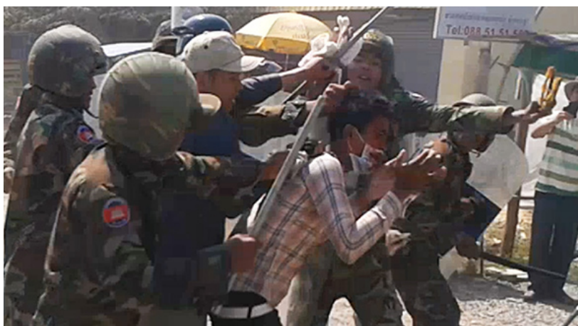
Outside Yakjin Garment factory on January 2, an Army special forces unit attacked workers with AK-47 rifles, police batons, metal pipes, knives, and slingshots.

The Cambodian garment industry's ongoing refusal to pay its workforce a minimally adequate wage – a refusal, in effect, dictated by the business practices of Western brands and retailers – has resulted in the worst episode of state violence and repression against civilians in Cambodia in more than a decade. 16 The January shootings have been broadly denounced by international governmental and nongovernmental organizations including the United Nations (UN), 17 the International Labour Organization (ILO), 18 Amnesty International, 19 and Human Rights Watch (HRW). 20 On January 9,