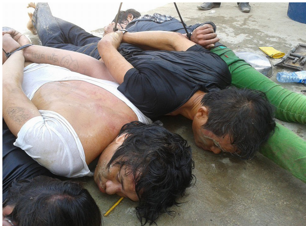
Twenty-three people (workers, protesters, and onlookers) were beaten and detained by the police on January 2. Twenty-one are still being held.

One of the detainees is an electrician employed by the factory Sabrina (Cambodia) Garment Mfg., a supplier of collegiate apparel to Nike. He reportedly had been asked by the factory's management to observe the protests outside the nearby Yakjin Garment factory. While watching the protests, he witnessed security forces vandalizing a number of motorcycles that were parked nearby. When the electrician tried to move his own motorcycle out of harm's way, he was beaten and arrested.