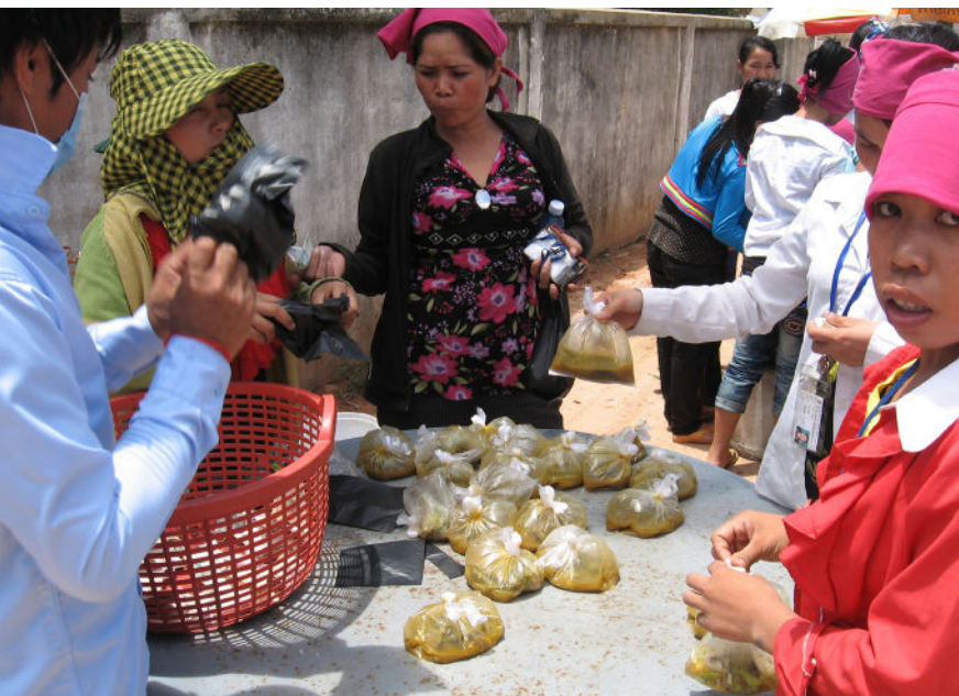
Workers buy food from vendors outside the factories whose wares are often half-spoiled goods from regular marketplaces.

The minimum wage, which was further increased to $100 per month in February 2014, is still grossly inadequate to sustain the basic needs of workers and their families, 30 and is far below one that provides "a decent standard of living compatible with human dignity," 31 as Cambodian law requires. In 2013, a Cambodian NGO, the Community Legal Education Center (CLEC), and a British NGO, Labour Behind the Label (LBL), calculated the minimum income necessary in Cambodia to support a garment worker or one of her dependents to be $150 per person per month. 32 Based on this figure, the minimum wage needed for a worker to support herself and two dependents would be $450 per month, nearly five times its current level.