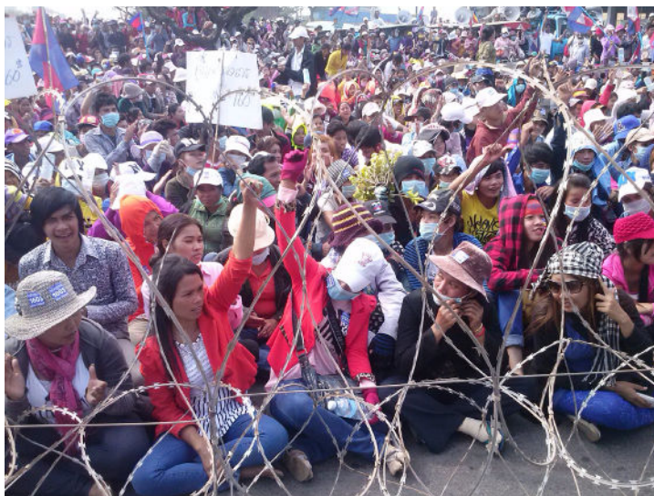
Workers protest nonviolently for higher minimum wage.

On December 30, Cambodia’s Ministry of Labor issued a letter warning five of the six union leaders mentioned in GMAC’s letter to cease inciting workers to strike. The Ministry again alleged, without factual support, that protesting workers had damaged factories’ property and forced employees to cease work. 69 Also that day, the GMAC refused to attend a meeting with the unions that had been called by the Ministry of Labor. 70